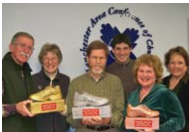
The CROP Walk raised $4,000 for MACC Charities. Winners were: Gold, St. Mary's Episcopal Church; Silver, Center Congregational Church; Bronze, South United Methodist Church.