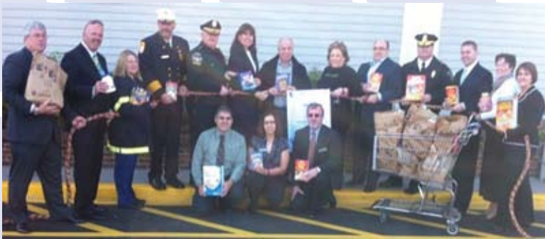
2010 Friendly Food Fight between the Towns of Vernon and Manchester – In this fight, everyone came out a winner.