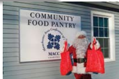
(Right) Santa delivered cookies for the homeless meal at the Manchester Country Club.